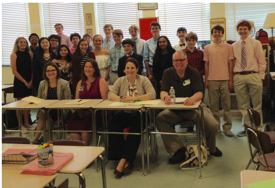
4B Class and their Guest Judges