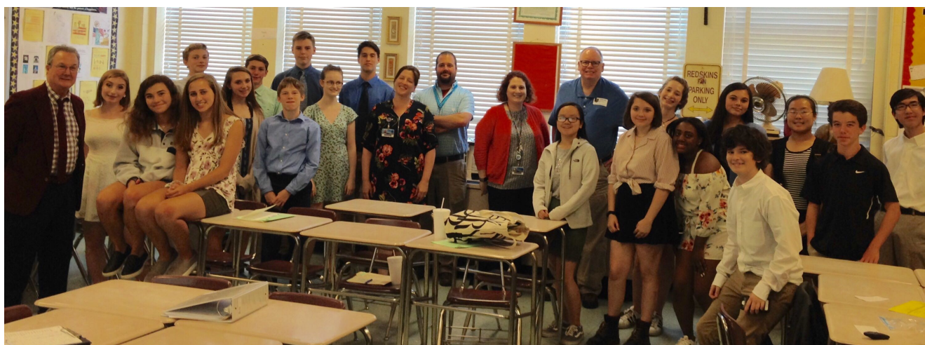
4A Class and their Guest Judges