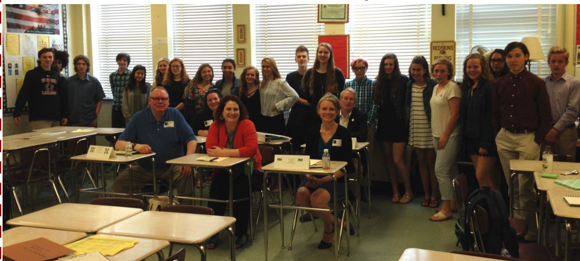
1A Class and their Guest Judges