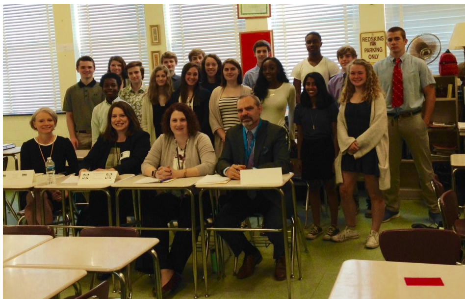
1B Class and their Guest Judges